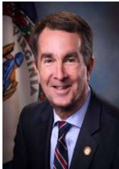
Virginia's Current Governor is Dr. Ralph Northam