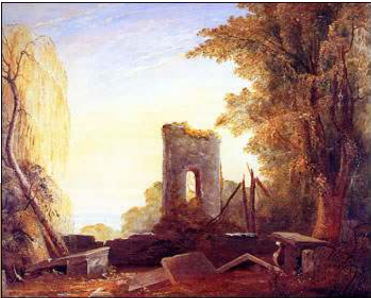
The ruins left behind in Jamestown

As the colony of Virginia grew, the needs of its people changed. The original capital located at _____ had many _____. One of the problems was the fact that the salt water of the surrounding river and bay contaminated the drinking water. This nasty water, in addition to mosquito born diseases (like Malaria), unhealthy _____ conditions and frequent fires, caused the leaders of the colony to look for a better location for the _____.