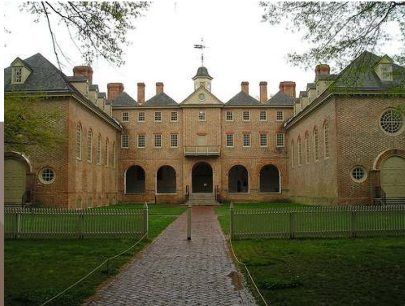
William & Mary

The burgesses thought it was a _____ and _____ place than Jamestown.