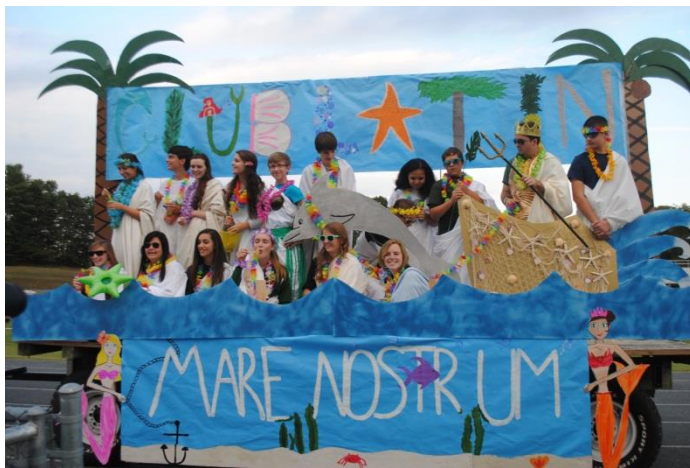
Club Latin had a toga party on their parade float.