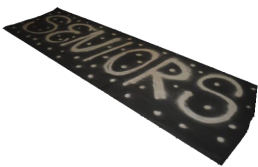
Senior Quotes & Formal pictures are due

Seniors need to make sure they come by Mrs. Lilley's room 42 to sign the senior sign out sheet. DUE BY FRIDAY, 12/20