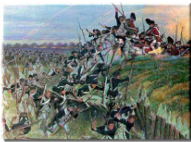
Battle of Yorktown Oct. 1781- American & French troops storming British fort.